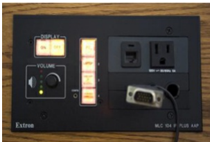
Lectern Guide (Buttons)

These guides describe the basic use of the Media Lecterns in Computer Classrooms: