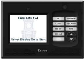
Lectern Guide (Touchscreen)